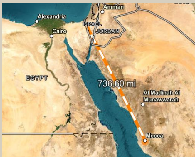
Figure 2 – Modern day location of Mecca/Kaaba 700+ miles away from Abraham's route.